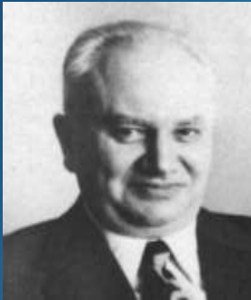
S.S. Kutateladze (1914–1986)