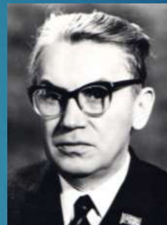
A.V. Luikov (1910–1974)