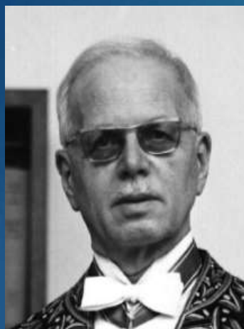
E.A. Brun (1898–1979)