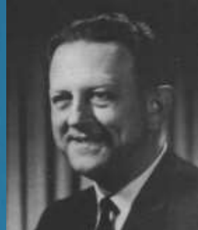
W.M. Rohsenow (1921–2011)